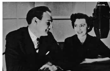
Cliff Michelmore and Jean Metcalfe in the studios of BFN Hamburg in 1949.