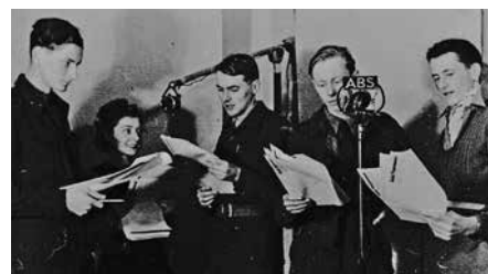
Announcers at the Army Broadcasting Service in Graz, Austria rehearsing a play.