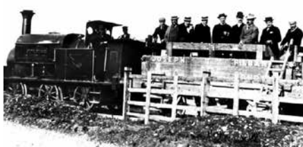
Basingstoke - Alton Light Railway Engine

Light railways had restrictions, being built, as the name suggests, to a lower standard than traditional routes, which meant that only lighter engines could be used and were restricted to a top speed of 25 mph. Our light railway was mainly single track with, initially, only three trains in each direction daily. Stations were built at Cliddesden, Herriard, Bentworth & Lasham and Butts Junction outside of Alton. While all the stations had sidings only Herriard had two platforms. The stations were hardly close to their village names and most of the cottages seen today close to them were built for the railway workers. The cost of the venture was £50,000, being a quarter of the typical budget had the line been laid to the usual standard.