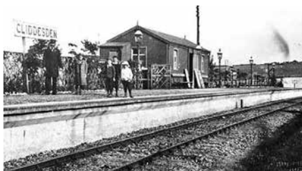
Basingstoke - Alton Light Railway Cliddesden Station

The total distance was only 12 miles and because of the stops and speed restriction the journey would take 45 minutes. During WWI the tracks were removed for use by the army in France. The company hoped that it would never reopen but due to public pressure the line was relaid and opened in 1924. It was never a commercial success and passenger services ended in 1932 but a goods service continued from Basingstoke as far as Bentworth & Lasham until the line eventually closed in 1936. The whole of the line was dismantled except for short stubs at either end – from Basingstoke in to the Thorneycroft factory (now the site of Morrisons supermarket) and from Butts Junction to Alton Park, the Treloar Hospital. These short stretches were used for goods traffic until 1967.