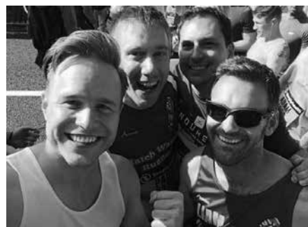
Hatchies fraternising with the stars at the Great North Run

If you want to try being part of the club, join us for a taster run on a Monday or Wednesday evening. For more details, please visit www.hwrrunners.co.uk , email us on enquiries@hwrrunners.co.uk or visit our Facebook page.