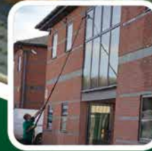
Safe, Efficient Ladder-Less Cleans