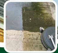
Refreshing, Driveway & Pathway Cleans