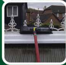
Conservatory Deep Cleans